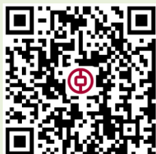
流動電話應用程式 (iOS/Android)